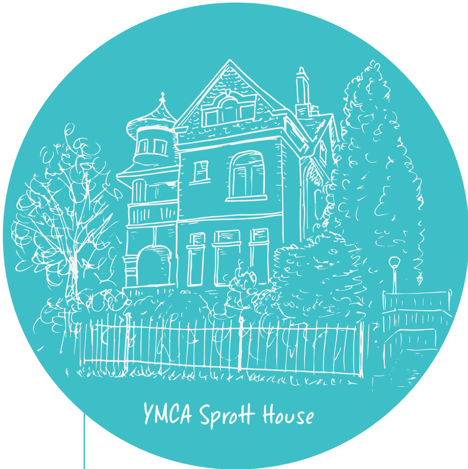
YMCA Sprrott House

Canada's first transitional housing program for LGBTQ2S youth